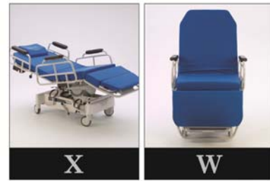
X SEAT TILT

Note: Not every option can be mounted on every chair or combinations. Call TransMotion Medical Customer Service before quoting.