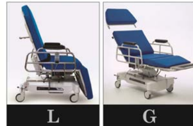
L LOWERED HEIGHT & SHORT LEG