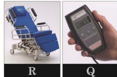
R FOLDING UPPER RAILS