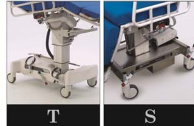
T TALL / TRIPLE COLUMN